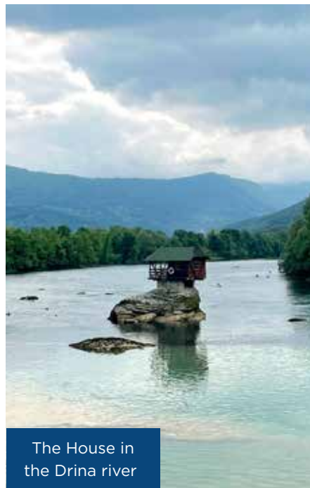
The House in the Drina river

The tour begins with a scenic 2.5-hour drive to Western Serbia, renowned for its untouched nature, delicious cuisine, and warm hospitality. The first stop is "Kapija Podrinja," a breathtaking viewpoint offering stunning views of the Drina River and surrounding mountains.