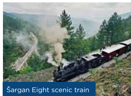
Šargan Eight scenic train

Next, we visit Bajina Bašta and the world-famous "House on the Drina River," a charming log cabin perched on a river stone, featured in National Geographic and a popular photography spot.